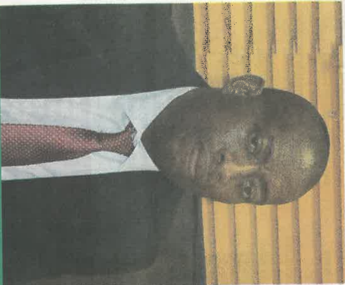
UMnu UMOS Zungu Inkhosi Yomnyango